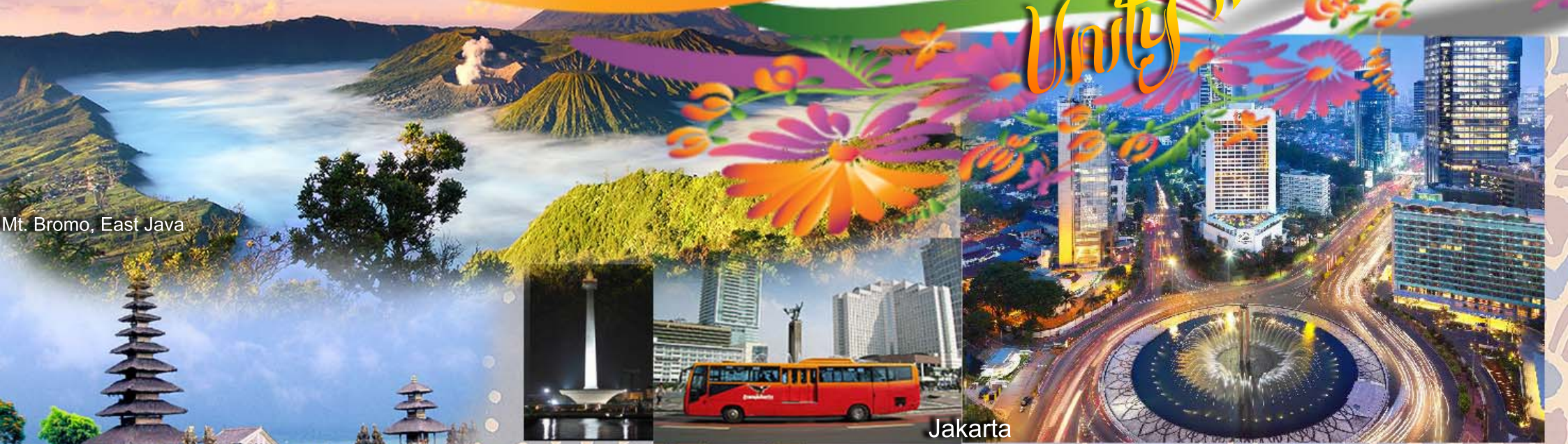
Mt. Bromo, East Java